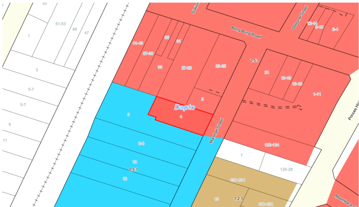
Wollongong Local Environmental Plan 2009, Floor Space Ratio (FSR) Map