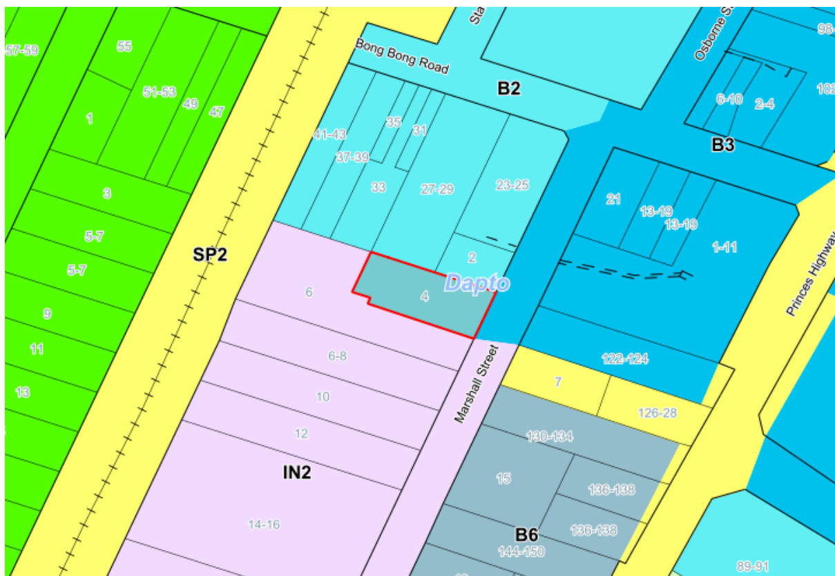
Wollongong Local Environmental Plan 2009, Zoning Map